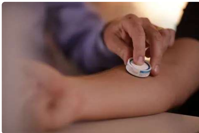
Vaxxas HD-MAP Application

https://www.businesswire.com/news/home/20201005005168/en/